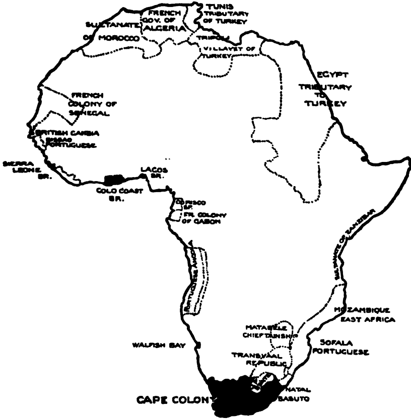
BRITISH AFRICA IN 1873.