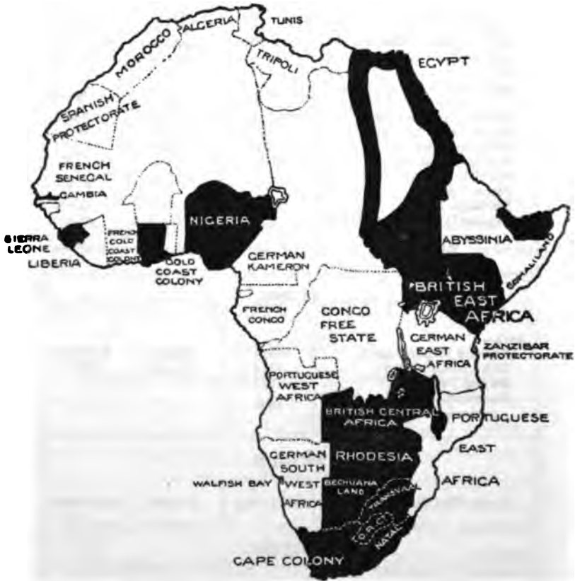
BRITISH AFRICA IN 1902.